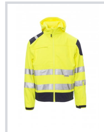
FLUORESCENT YELLOW/NAVY BLUE