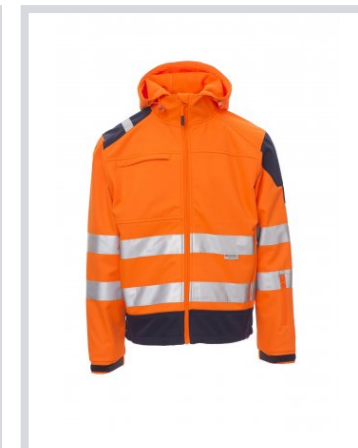
FLUORESCENT ORANGE/NAVY BLUE