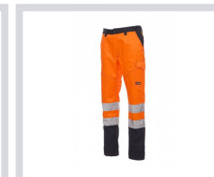
FLUORESCENT ORANGE/NAVY BLUE