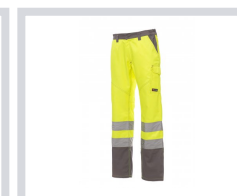
FLUORESCENT YELLOW/STEEL GREY