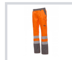
FLUORESCENT ORANGE/STEEL GREY