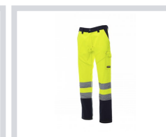
FLUORESCENT YELLOW/NAVY BLUE